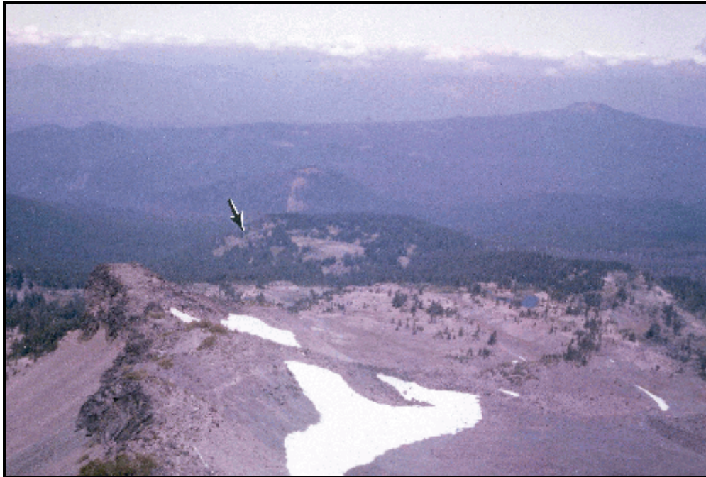
Figure 3. Obsidian Cliffs Plateau as seen from the summit of the Middle Sister. Taken facing west.